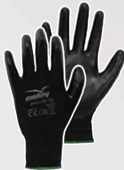
Skill N2 S00134-0180