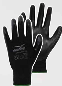
Skill N2 S00134-0180