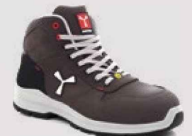
Protector 2.0 001486-0086