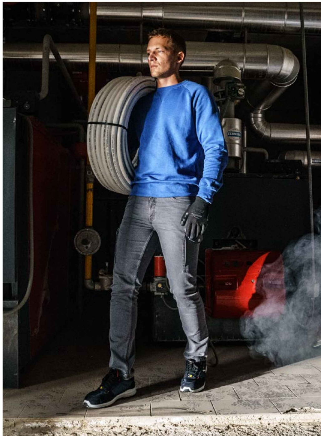
➤➤➤➤ Mistral+, Hummer, Get Texforce Low, Skill N2