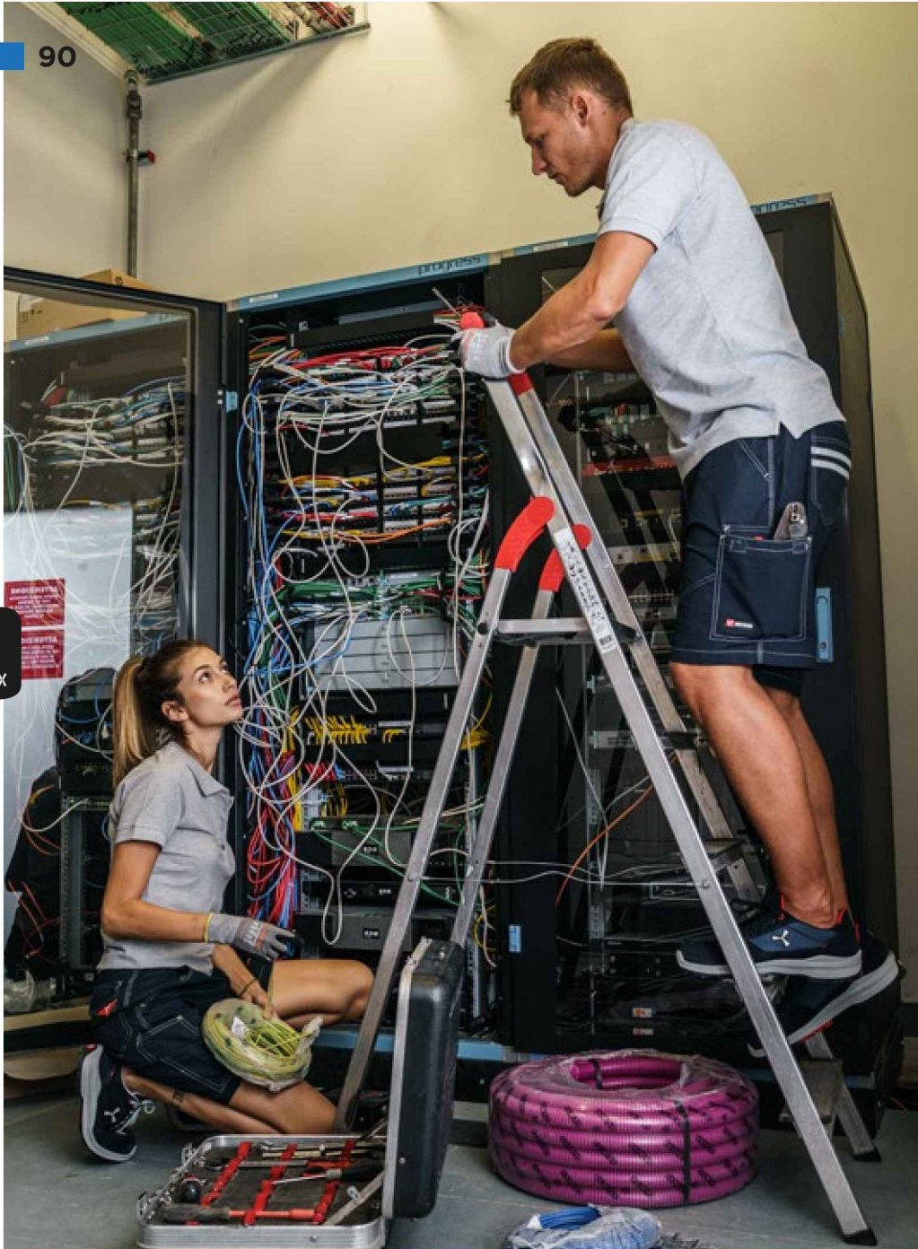
//// Venice Lady Melange, Venice Melange, Caracas, Get Fresh Ld Low, Get Texforce Low, 01-101, 01-501