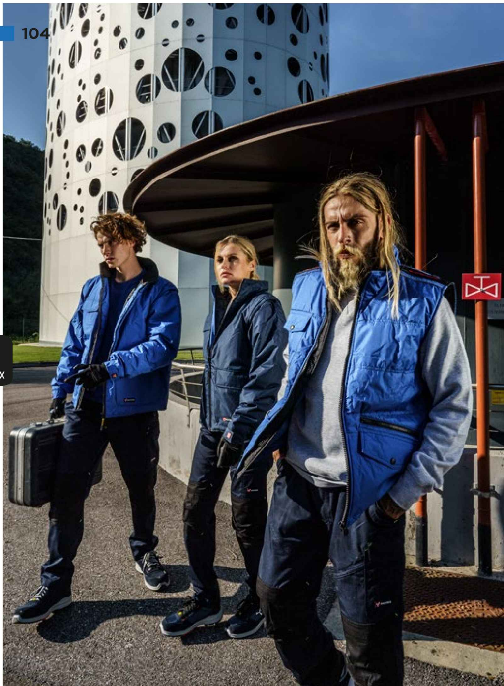
Escape, Mig 2.0, Mistral+, Sunset, Sunset Lady Melange, Worker Tech, Get Fresh Low, Get Texforce Ld Low, Skill N2