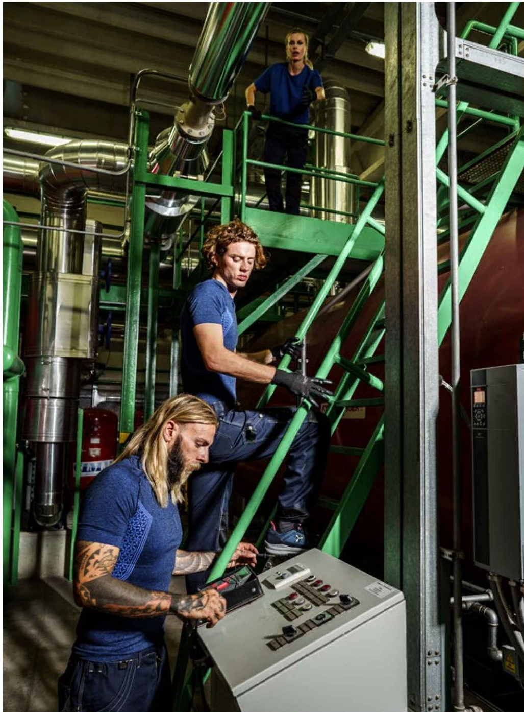
Sunset Lady, Thermo Pro 160 SS, Worker Tech, Viking, Get Texforce Low, Skill N2