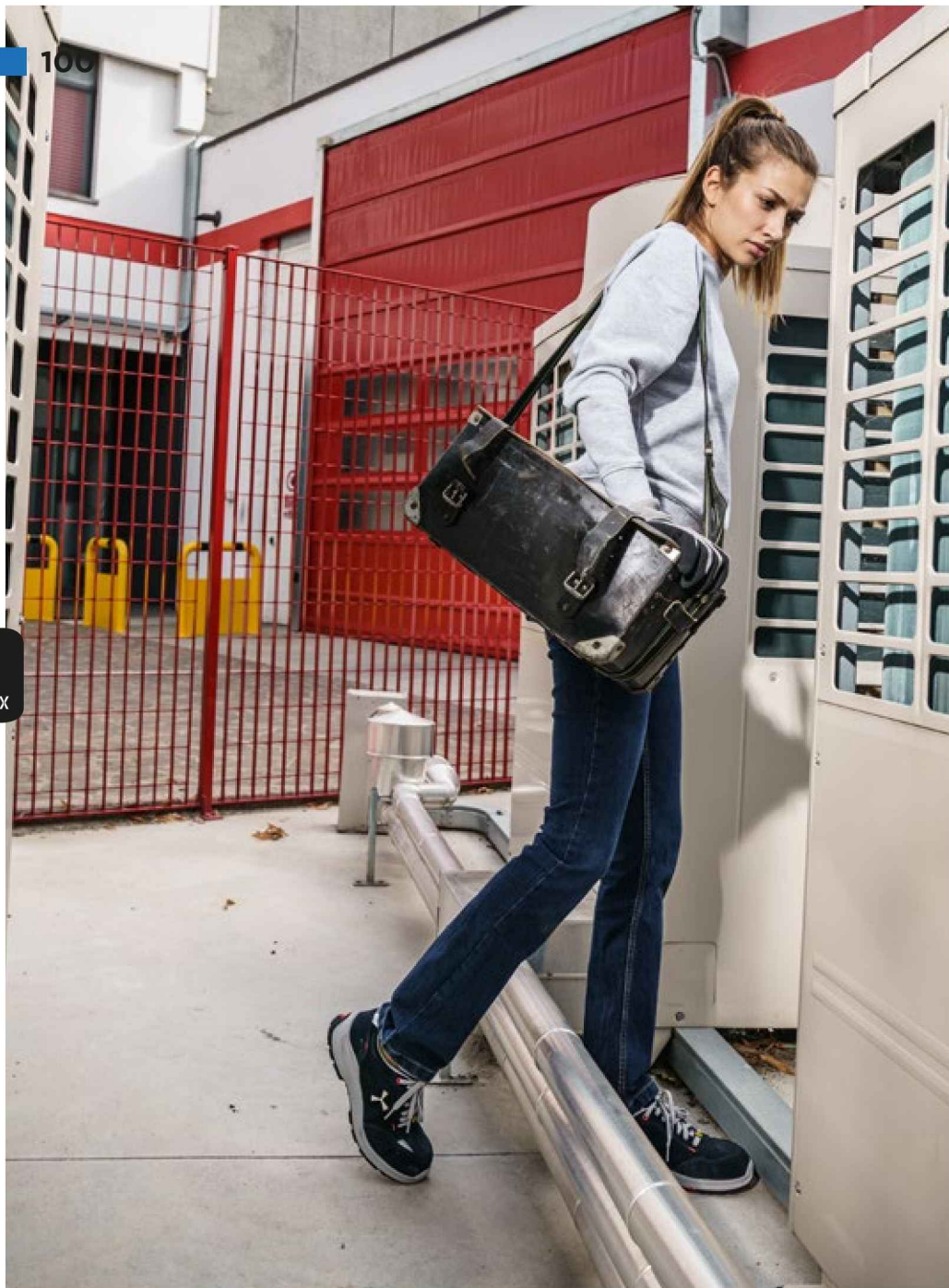
➤➤➤➤ Mistral+ Lady, Mustang Lady, Get Fresh Ld Low, 01-501