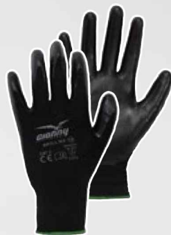
Skill N2 S00134-0180