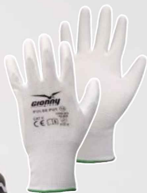
Pulse PU1 S00085-0181