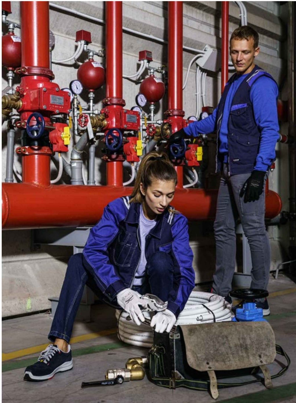
Arizona, Tucson, Mistral+ Lady, Mistral+, Mustang Lady, Hummer, Get Fresh Ld Low, Get Texforce Low, Pulse PU1, Skill N2