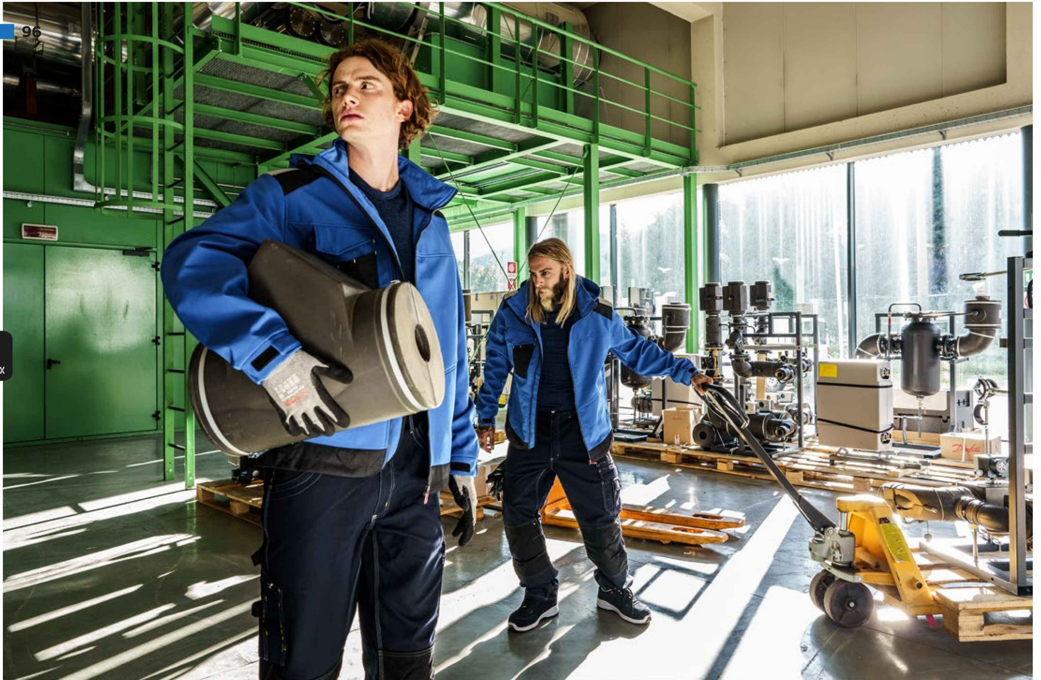
Performer 2.0, Thermo Pro 160 SS, Viking, Get Fresh Low, 01-501