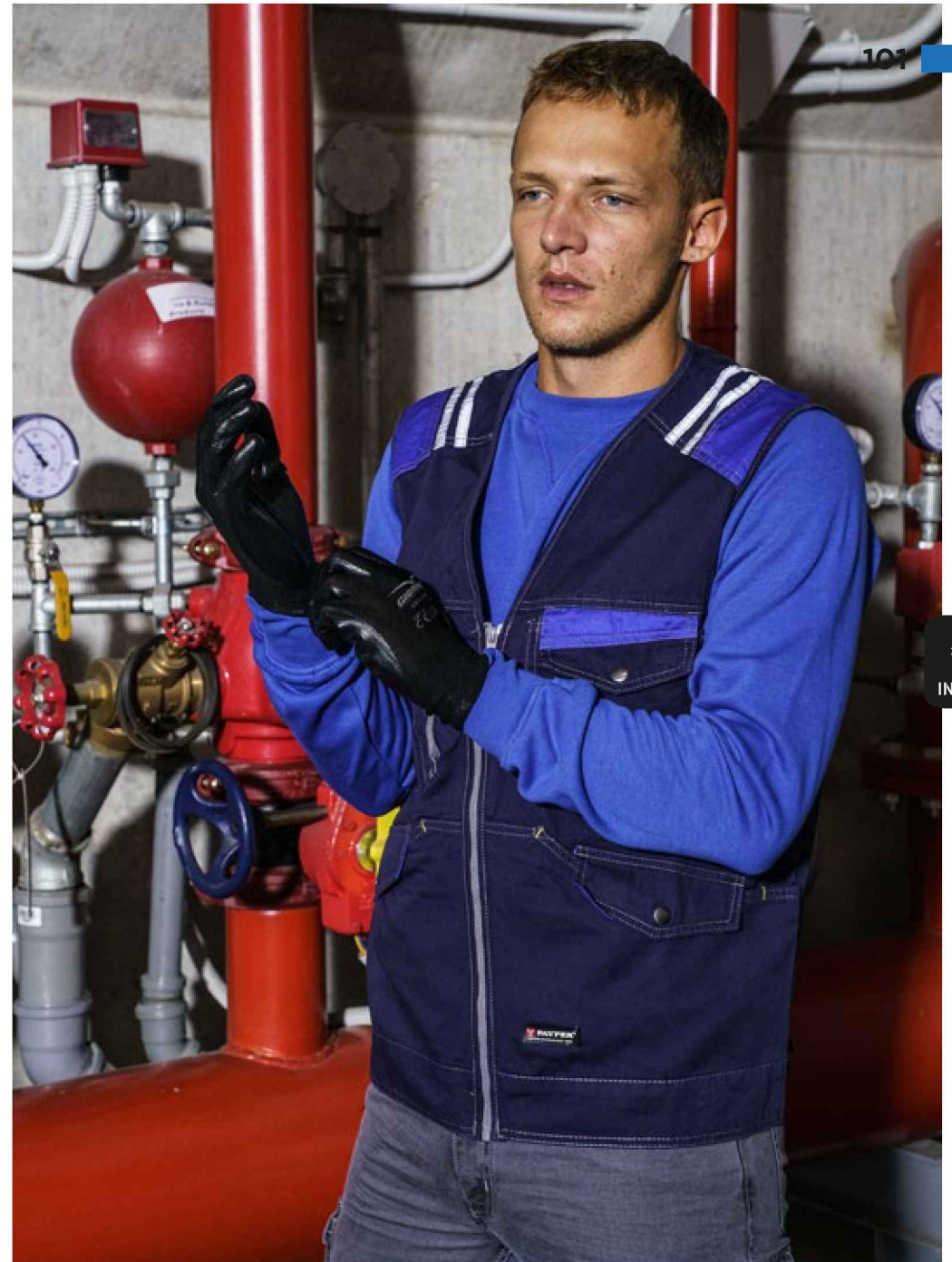
Tucson, Mistral+, Hummer, Skill N2