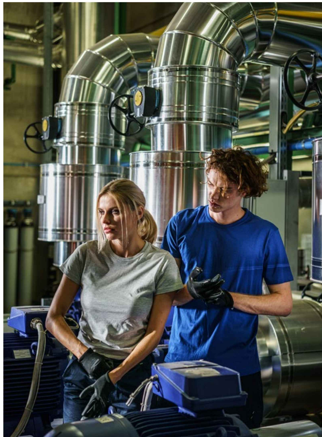
Sunset Lady Melange, Sunset, Worker Tech, Skill N2